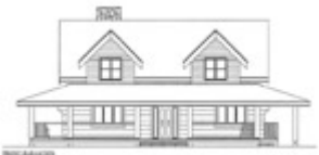
Ganges Harbour 2388 SQ FT 1392 main floor 996 upper floor