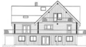
Port Alberni 2468 SQ FT 1600 main floor 868 upper floor