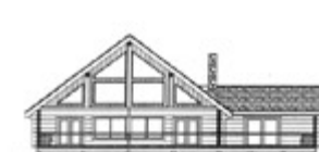
Sointula 2699 SQ FT 1969 main floor 730 loft