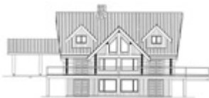
Denman Island 2498 SQ Ft 1420 main floor 1078 upper floor