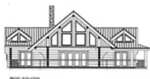
Silva Bay 2530 SQ FT 2030 main floor 500 loft