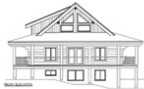
Saturna 2131 SQ FT 1385 main floor 746 upper floor