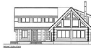
Oak Bay 2120 SQ FT 1280 main floor 840 upper floor