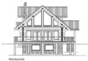
Otter Point 2040 Sq Ft 1176 main floor 864 loft

Copyright © Norse Log Homes Toll Free: 1-877-390-3344 Website: www.norseloghomes.com